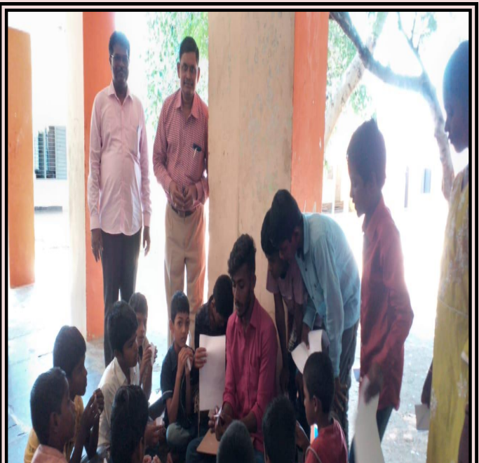
School Head Master was observing the crafting