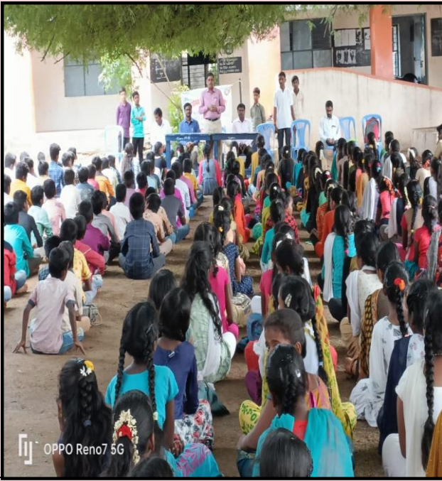
Volunteers Cleaning the campus