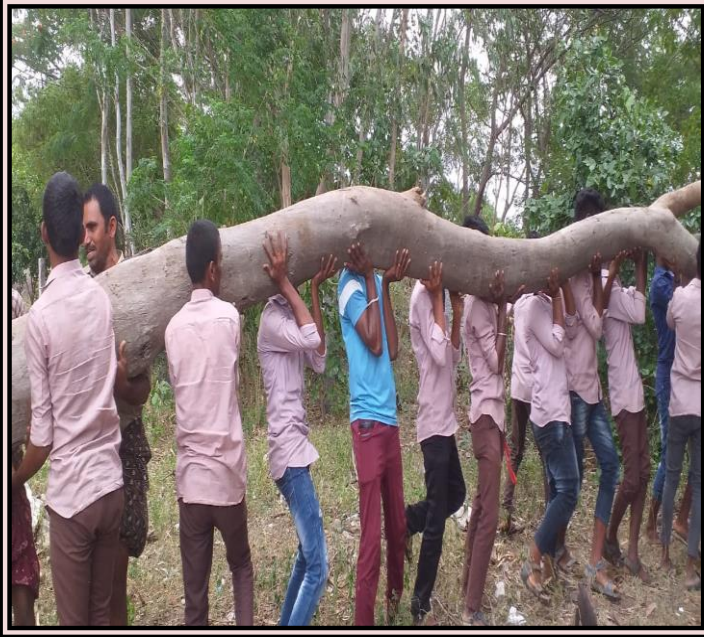
Volunteers were doing Sramadaan at Sri Sanjappa Thatha Temple