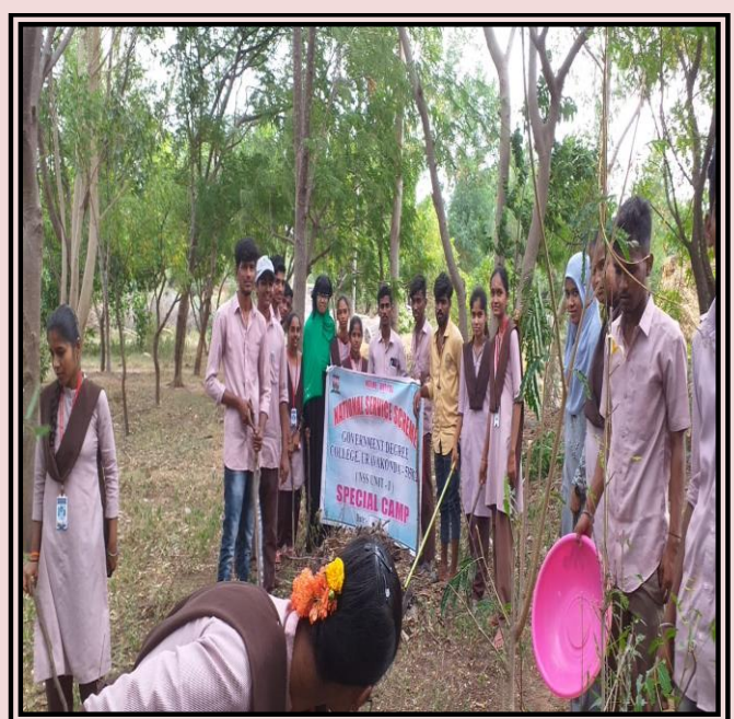
Volunteers were removing the wastage and thorny bushes