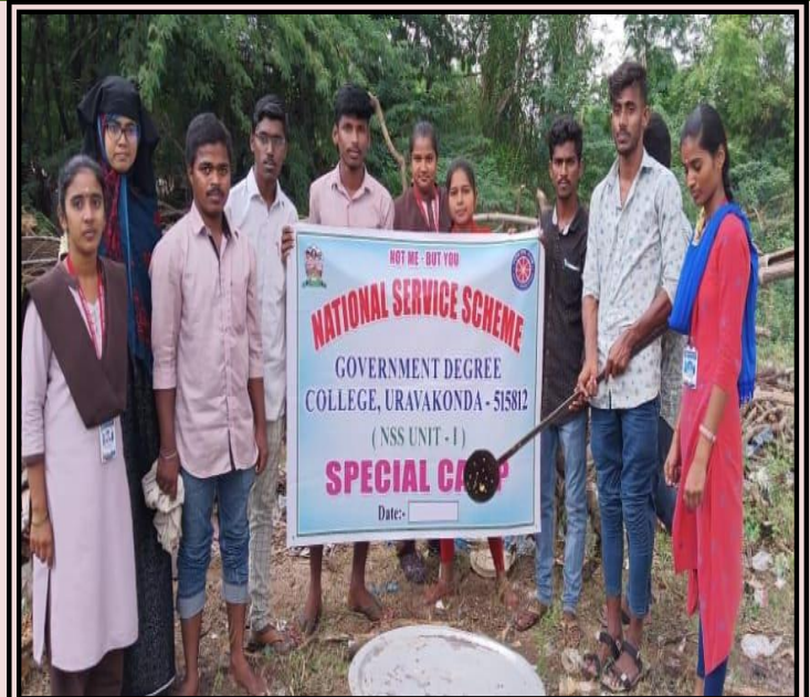
Volunteers are cooking food