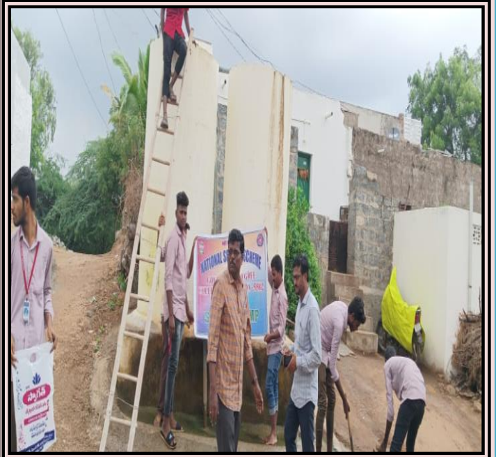
Volunteers are cleaning drainage and water Tank at BC Colony