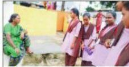
మహిళకు అవగాహన కల్పిస్తున్న విద్యార్థినులు

ప్రభుత్వ వార్త : శుభ్రమైన నీటిని సేవించడం, పరిసరాలను పరిశుభ్రంగా ఉంచుకోవడం ద్వారా రోగాలు దరిచేరవని ఎన్ఎస్ఎస్ వాలంటీర్లు గ్రామస్థులకు అవగాహన కల్పించారు. ఉరవకొండ ప్రభుత్వ డిగ్రీ కళాశాల ఎన్ఎస్ఎస్