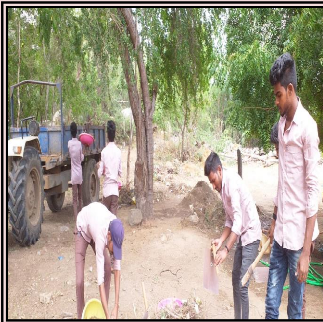
Volunteers were loading the wastage on to the tractor