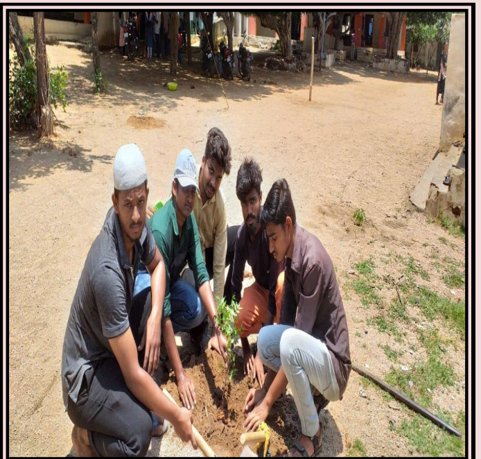
Volunteers were planting saplings