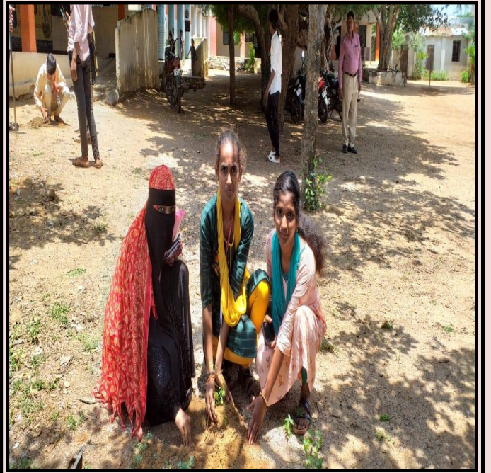
Volunteers were planting the saplings