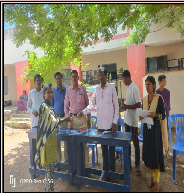
Head master distributing Prizes