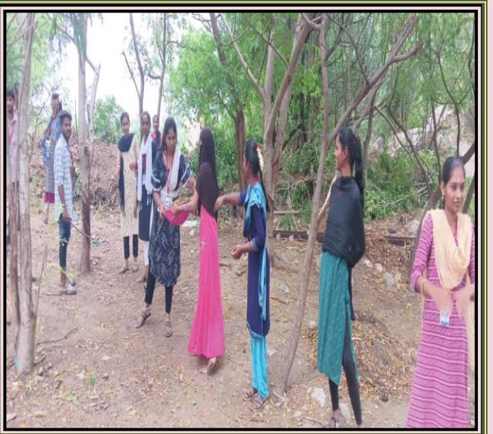
Volunteers removing wastage the wastage