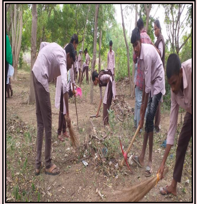
Volunteers removing thorny bushes surrounding the temple