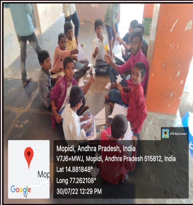
Volunteers training the children in crafting