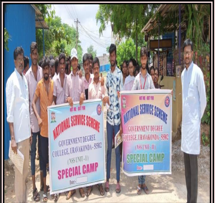
Volunteers are taking rally on Health and Hygiene

In the evening session all the volunteers actively participated in cultural events like musical chairs role-plays' games and sports.