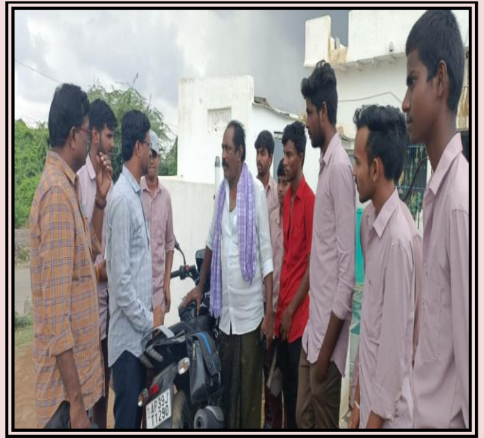
Volunteers were interacting with village people