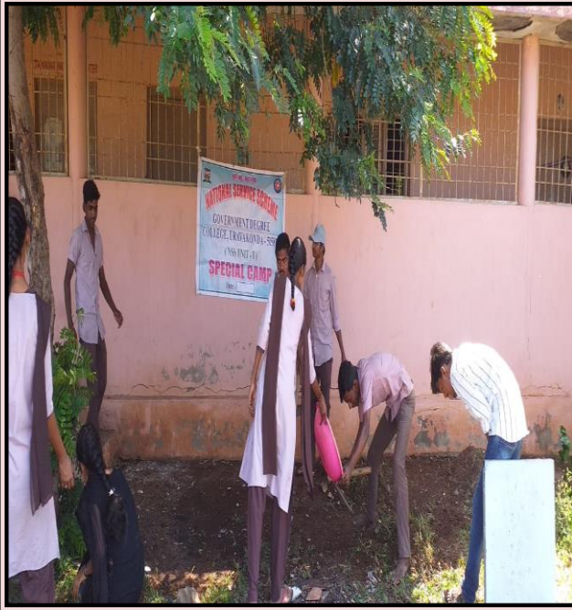
Volunteers Cleaning the campus