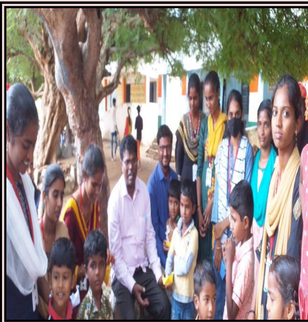
NSS P.O and volunteers were interacting with children