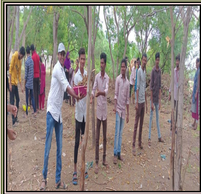
Volunteers are removing wastage