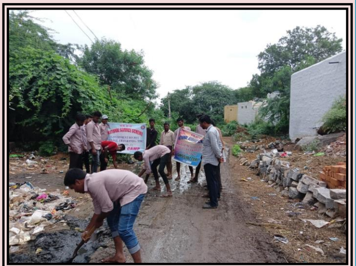
Volunteers are cleaning drainage at SC Colony