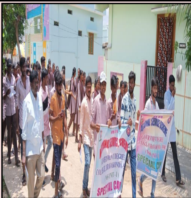
Volunteers are taking rally on Social Events