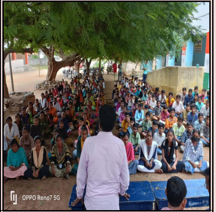
Volunteers were planting the saplings