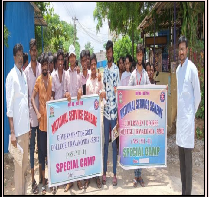
Volunteers are taking rally on Health and Hygiene