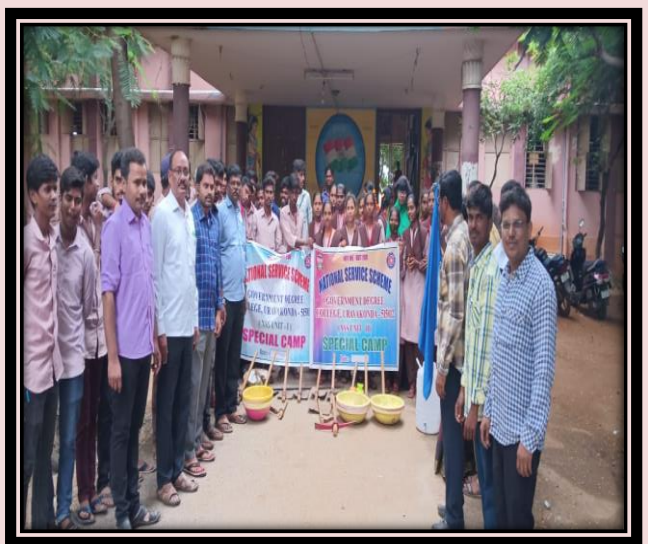
Inaugural Function at Mopidi village