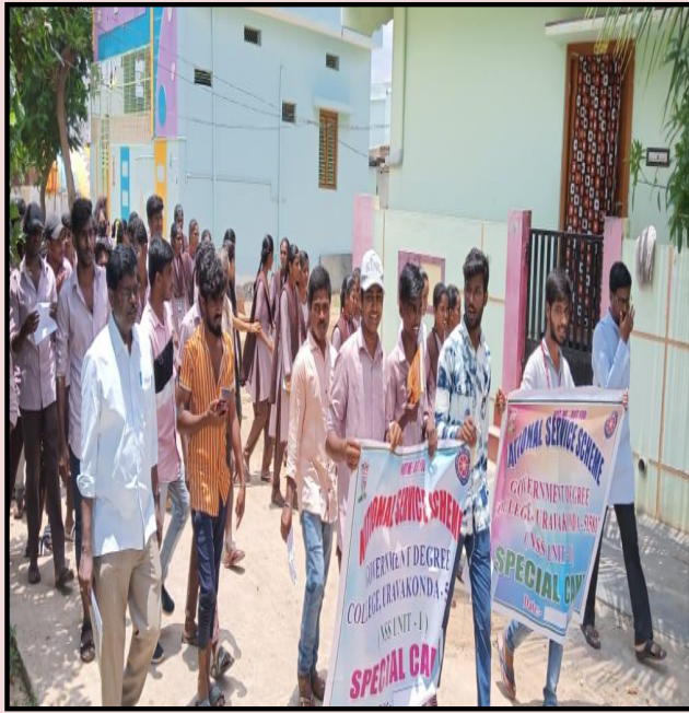
taking rally on Social Events