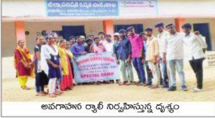
అవగాహన ర్యాలీ నిర్వహిస్తున్న దృశ్యం

-మోపిడి గ్రామంలో కొనసాగుతున్న ప్రత్యేక శిబిరం