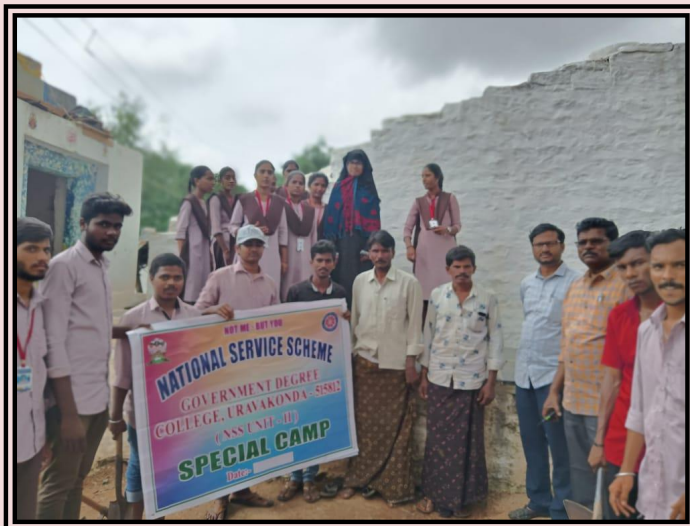
Volunteers making campaign about health and Hygiene