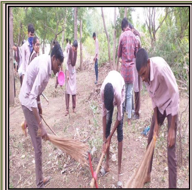
Volunteers are sweeping the temple ground