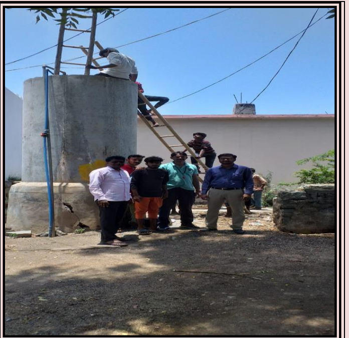
Volunteers were cleaning water tank