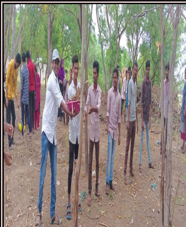
Volunteers are cleaning the surrounding of the temple