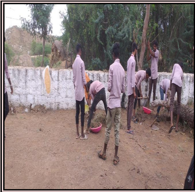
Volunteers were doing Sramadaan at Sri Sanjappa Thatha Temple