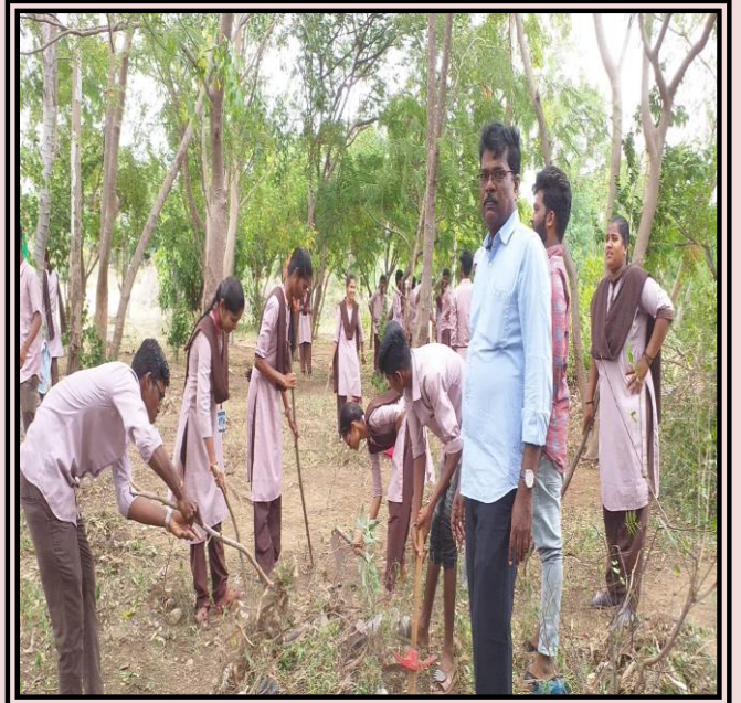
Volunteers were leveling the compound at Sri Sanjappa Thatha Temple