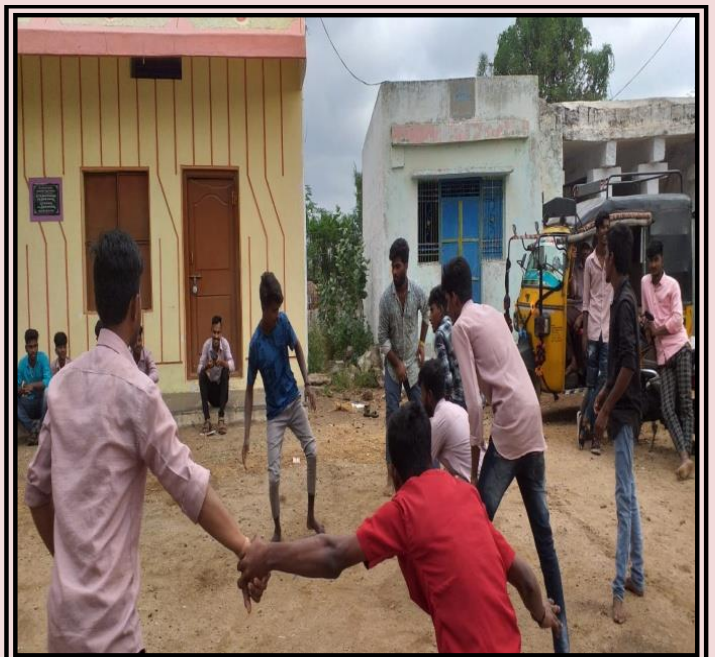
Volunteers are playing Kabaddi game