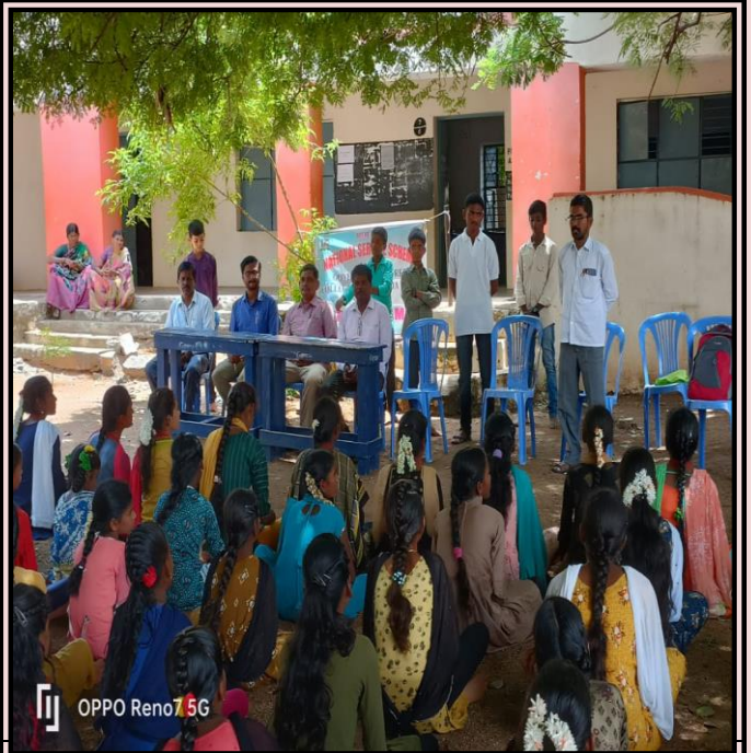
Volunteers were planting the saplings