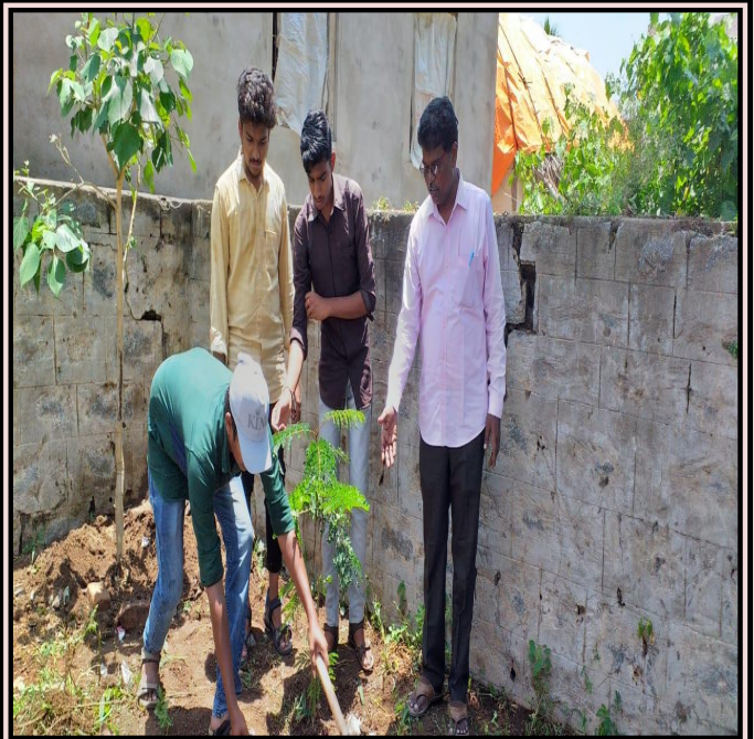
Volunteers were cleaning surrounding of the plants