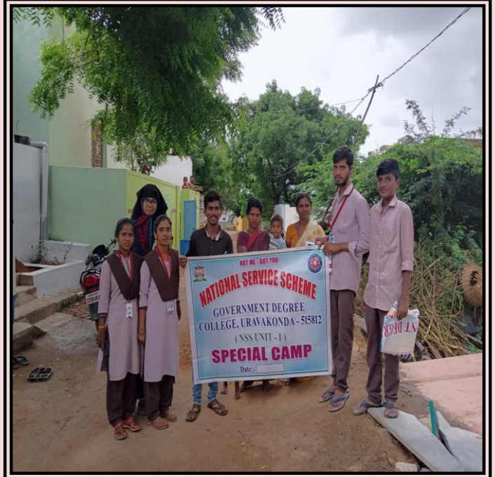
Volunteers making campaign about health and Hygiene