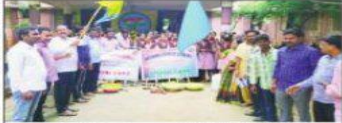
ప్రత్యేక శిబిరానికి వెళుతున్న ఎన్ఎస్ఎస్ వాలంటీర్లు