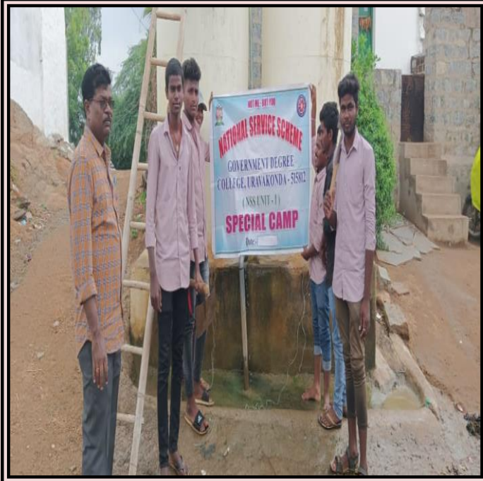
Volunteers were cleaning the water tank at BC Colony