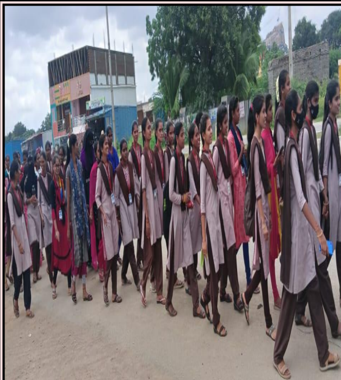
Volunteers taking a rally on Health and Hygiene